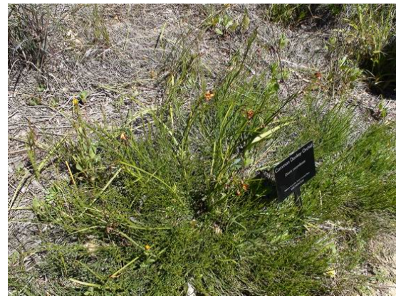
Common Donkey Orchid (Diuris corymbosa).

What orchid expedition in SW Western Australia would be complete without the ever popular spider orchids. This one is Caladenia georgeii , the Tuart Spider Orchid, (well this is the identification friends in WA supplied, and who am I to disagree with the experts.)