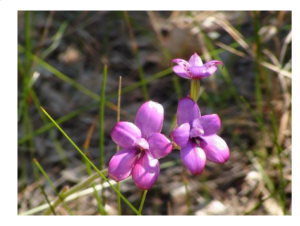
The enamel orchid (Elythanthera brunonis),