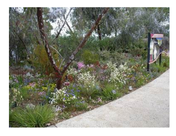
and even more themed gardens,