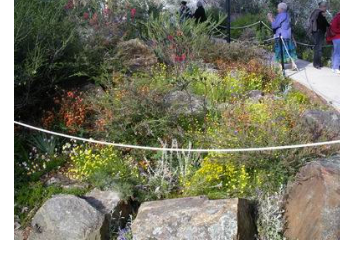
and more colourful gardens,